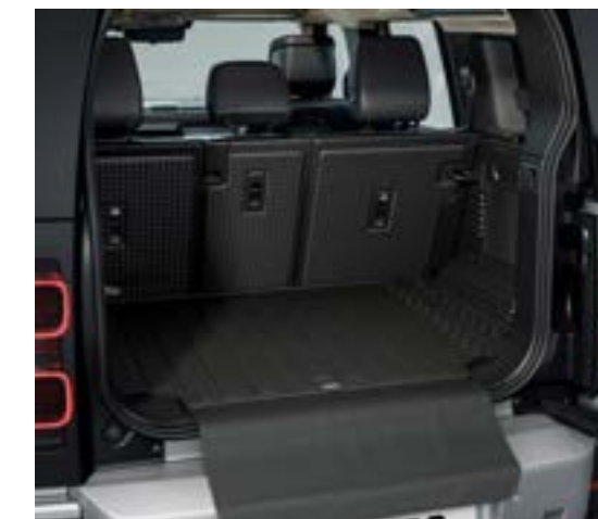
110, 5 Seat, Rubber and Luxury Mats Provides the ultimate protection and a stylish finishing touch. The Interior Protection Package includes the loadspace rubber mat with bumper protector and luxury carpet mats. For 110 only. For vehicles with 5 seats. $500