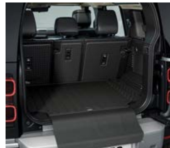
110, 5 Seat, Rubber and Luxury Mats Provides the ultimate protection and a stylish finishing touch. The Interior Protection Package includes the loadspace rubber mat with bumper protector and luxury carpet mats. For 110 only. For vehicles with 5 seats. $800