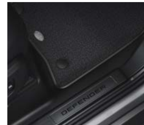
90, with Rubber and Luxury Mats Provides the ultimate protection and a stylish finishing touch. The Interior Protection Package includes the loadspace rubber mat with bumper protector and luxury carpet mats. For 90 only. $900