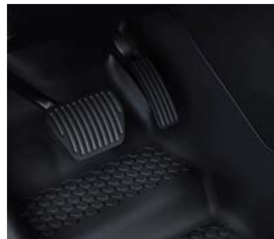
90, with Rubber Mats Provides the ultimate protection and a stylish finishing touch. The Interior Protection Package includes the loadspace rubber mat with bumper protector and deep-sided rubber floor mats. For 90 only. $700